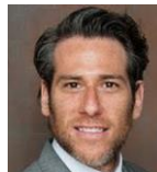
Sasha Strauss Innovation Protocol